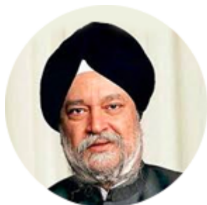
Hardeep Singh Puri

Minister of State for Commerce and Industry